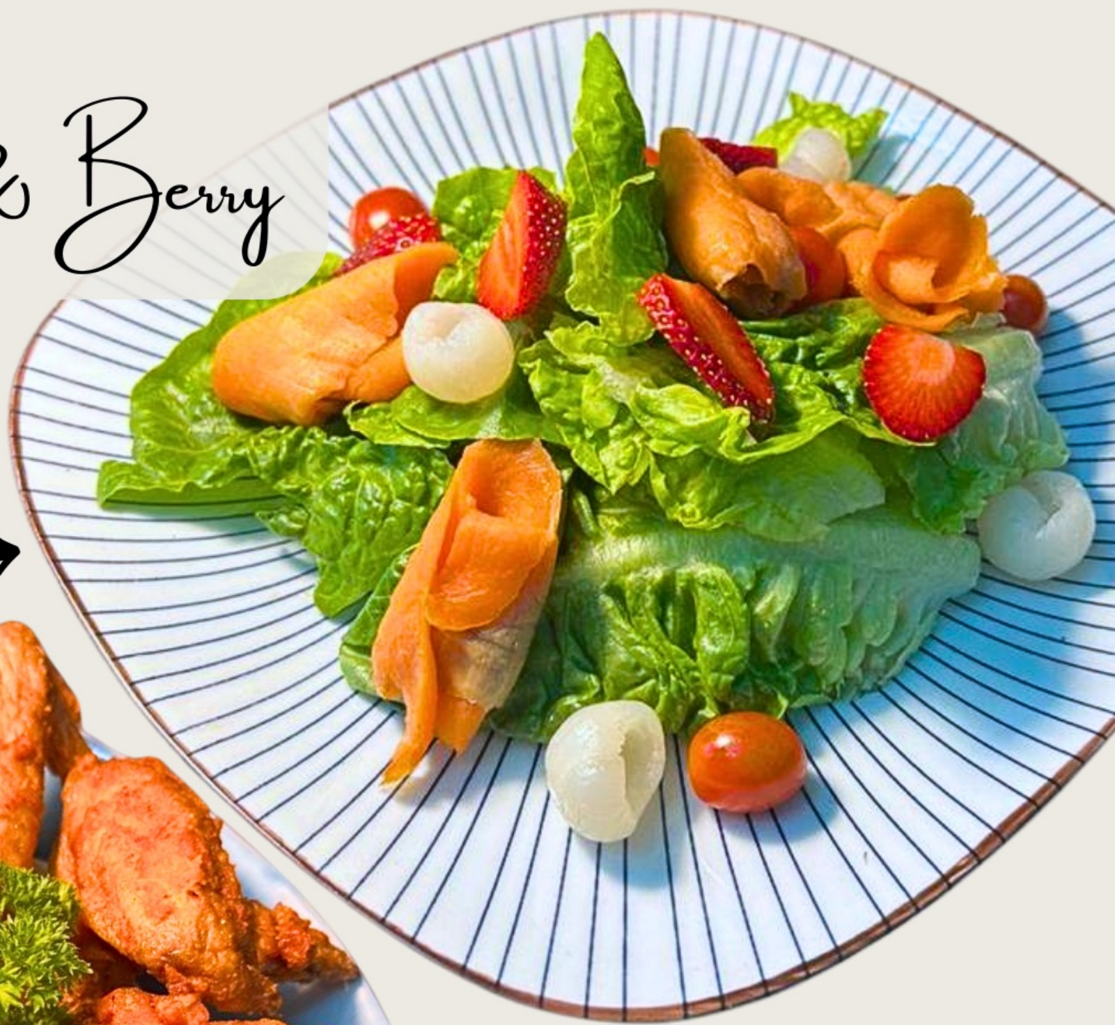
Salmon & Berry Salad