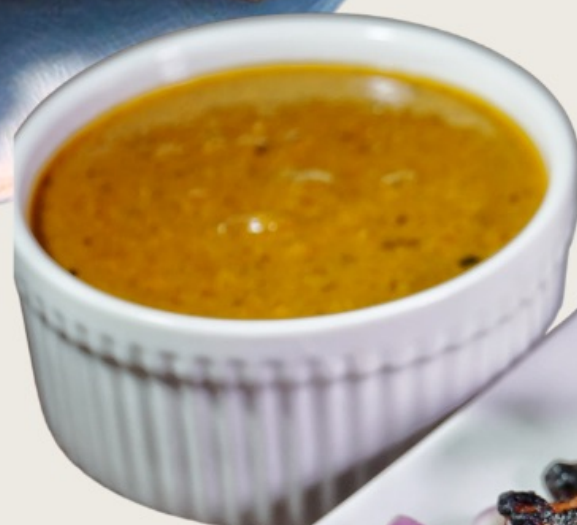
Clubhouse Satay Putrajaya