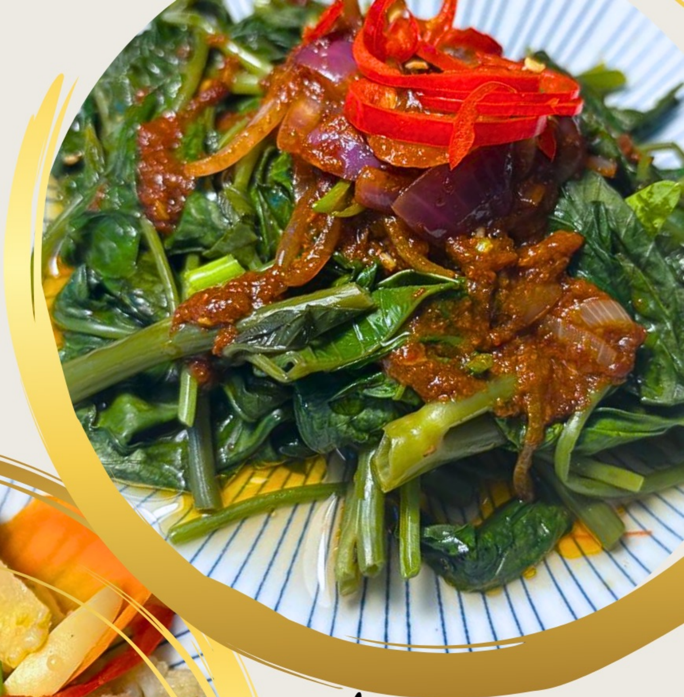
Stir fried kangkong