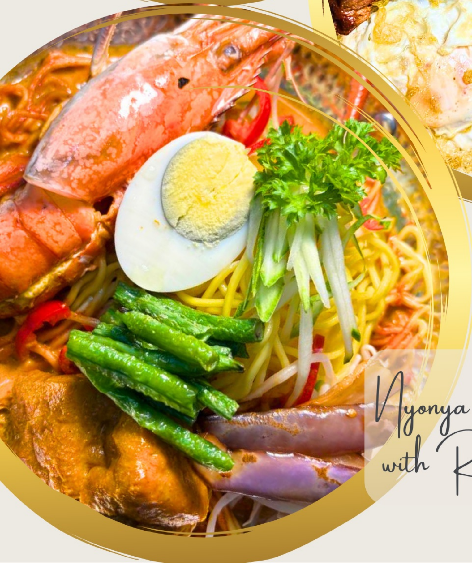
↖ Nyonya Curry Laksa ↗ with River Prawn