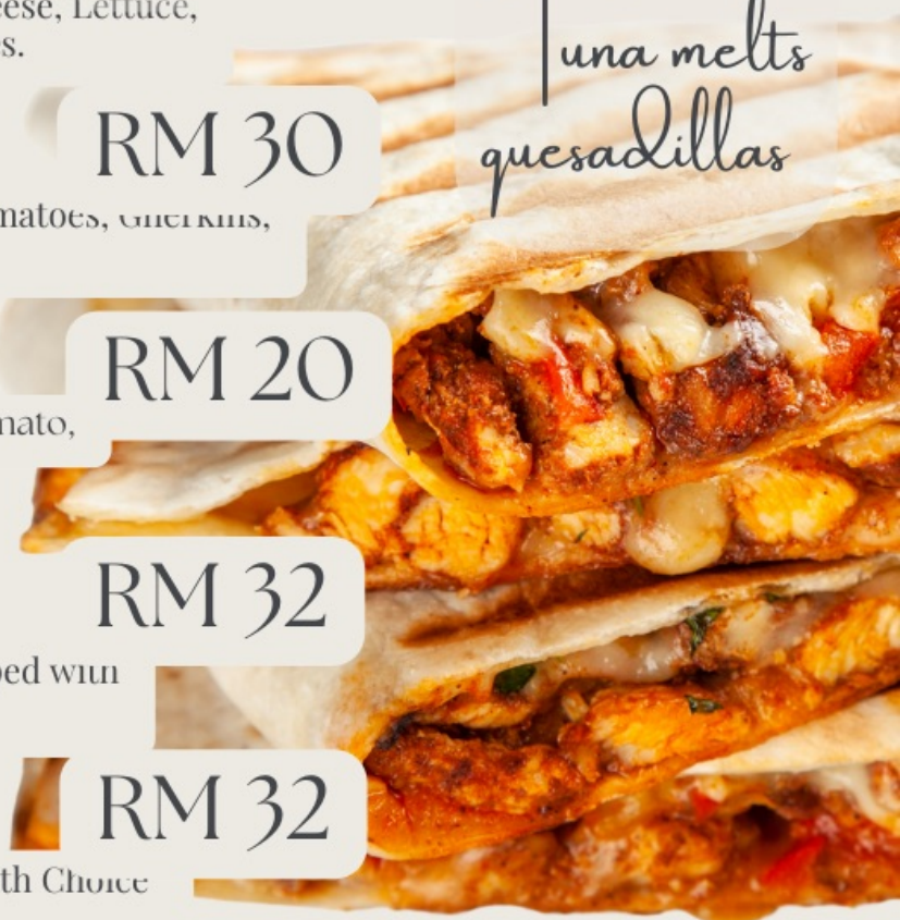
Tuna melts quesadillas