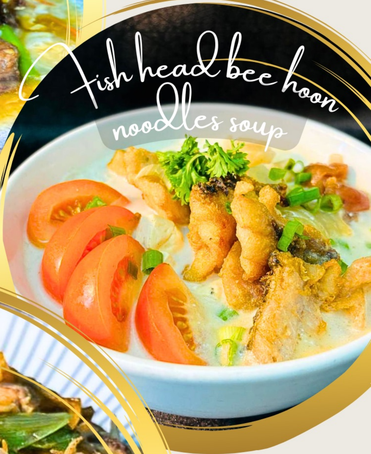
Fish head bee hoon noodles soup