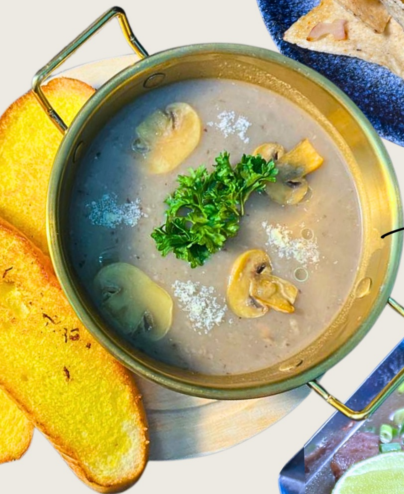
Truffle mushroom soup