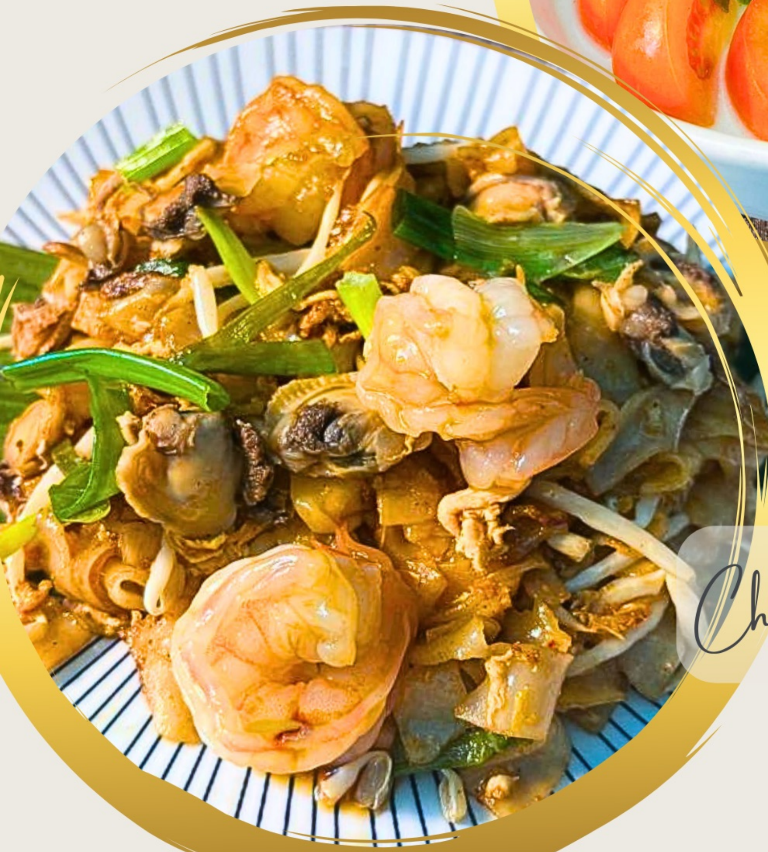
↖ Char Kuey Teow