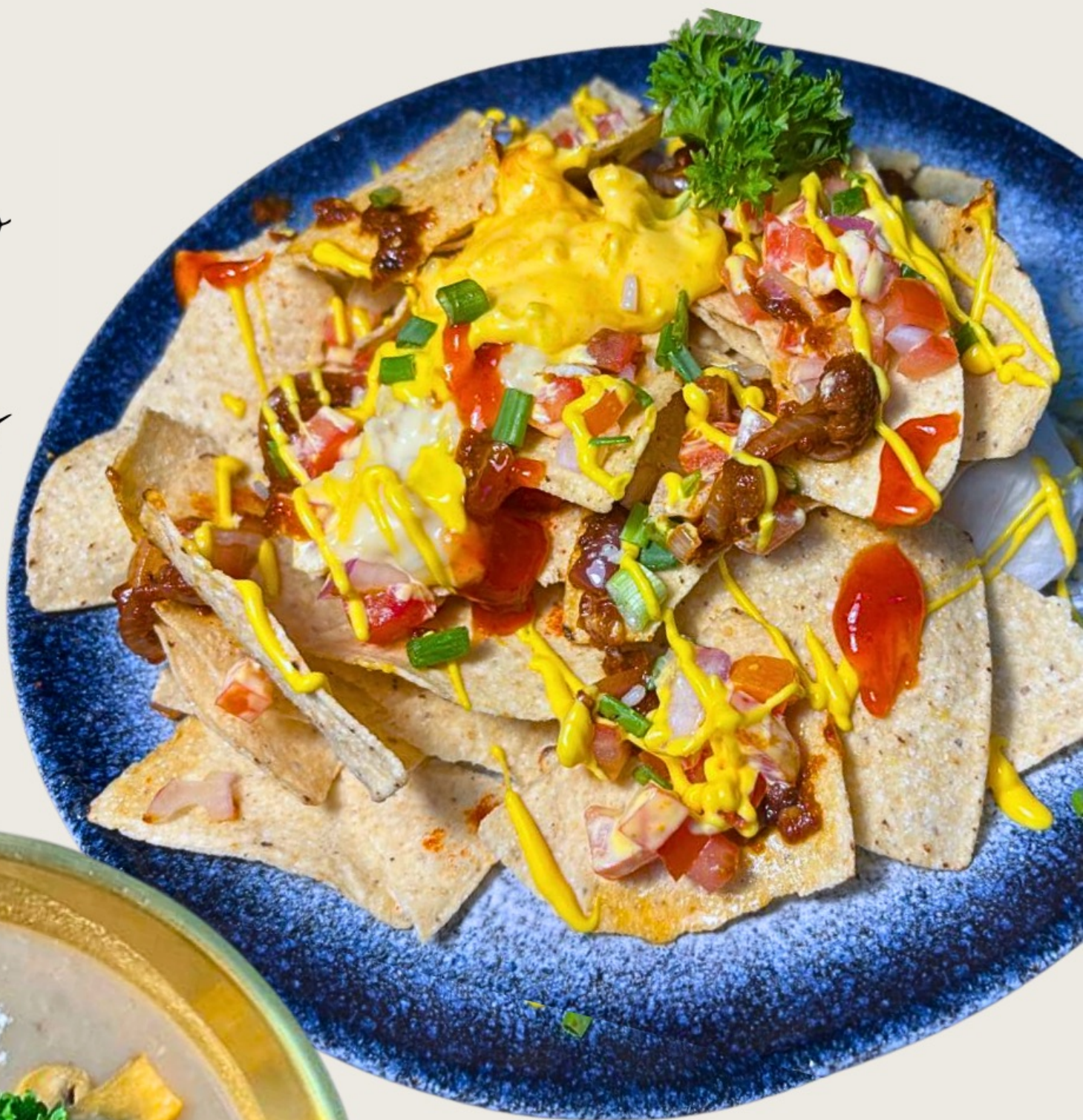
Macho's Chip with Dipping