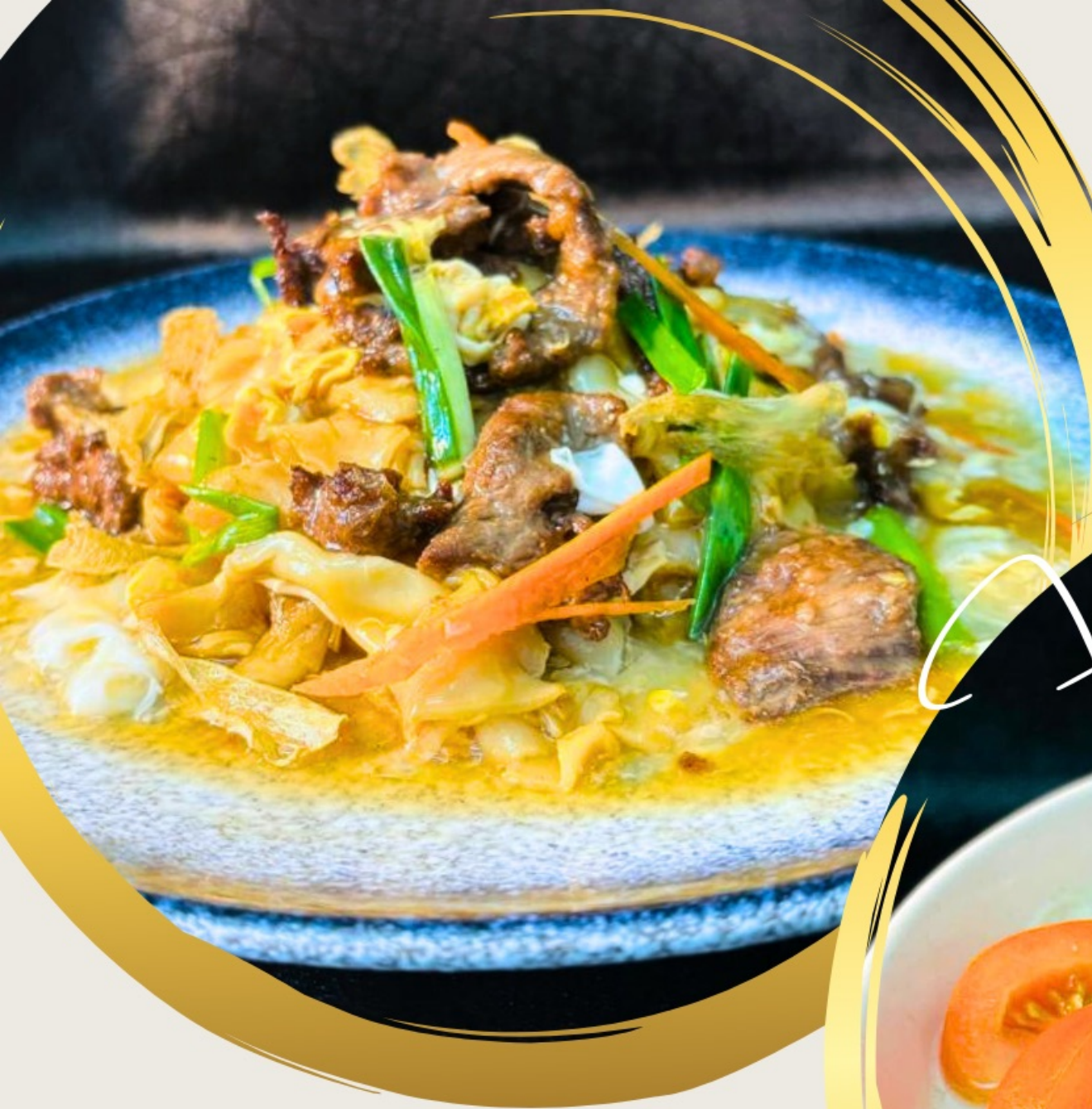
↖ Cantonese fried noodles (kuey teow)