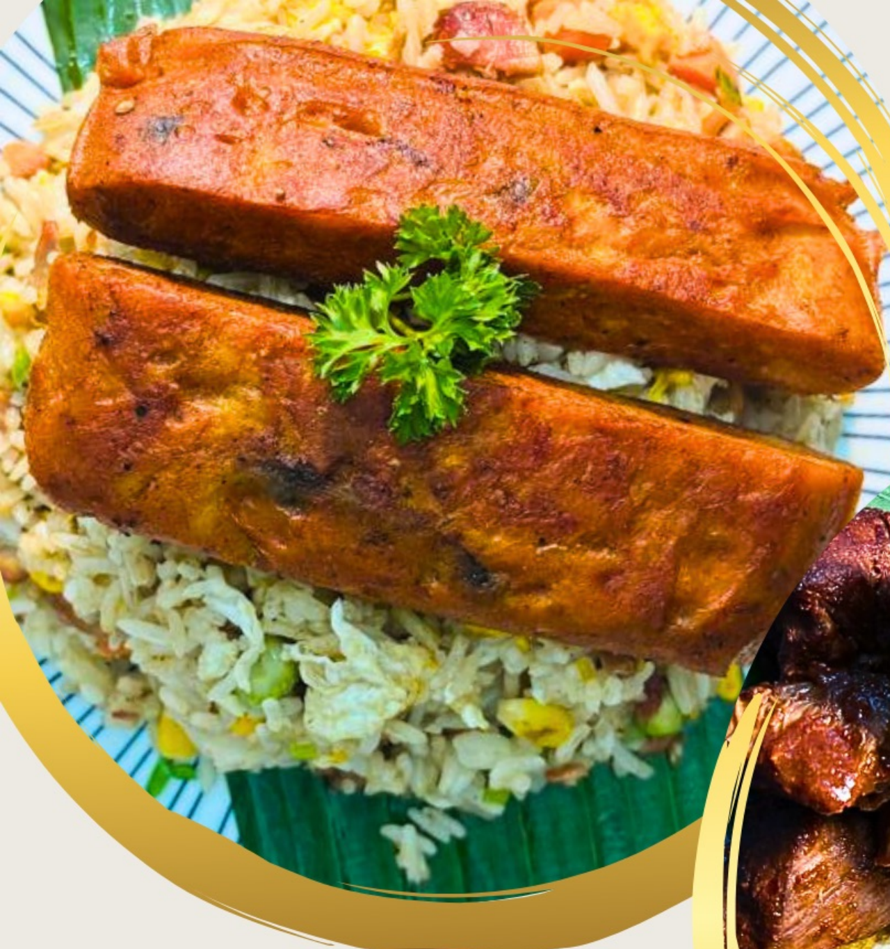
↖ Otak-otak fried rice ↗ Lamb fried rice